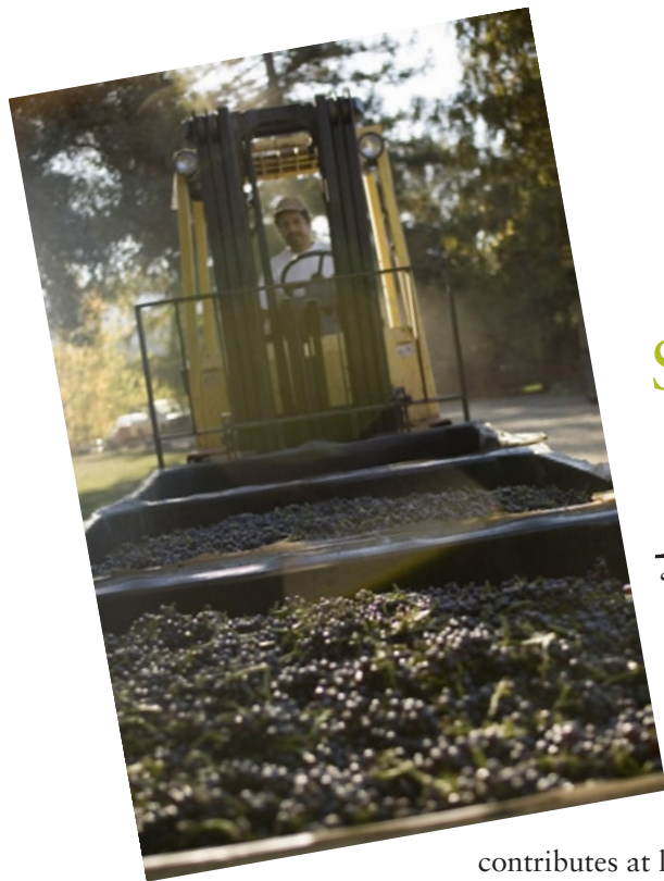
Manuel unloads bins of Syrah ready for processing into wine. We made Navarro's first Syrah in 1995 but it wasn't until the 2002 vintage that we started adding Grenache and Mourvèdre because we like Aussie SGM blends.