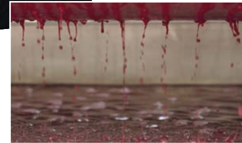
The juice pan when pressing Pinot Noir.

destemmed into fermenters, each tank holding about 1,200 pounds of fruit (above, left). After fermentation, the wine was racked to French oak barrels and aged eleven months. This cool vintage produced wines with bright red-fruit flavors, crisp acidity and delightfully modest alcohol. Gold Medal winner.